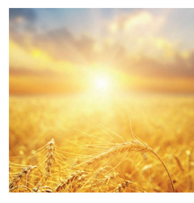
2022 SUSTAINABILITY REPORT